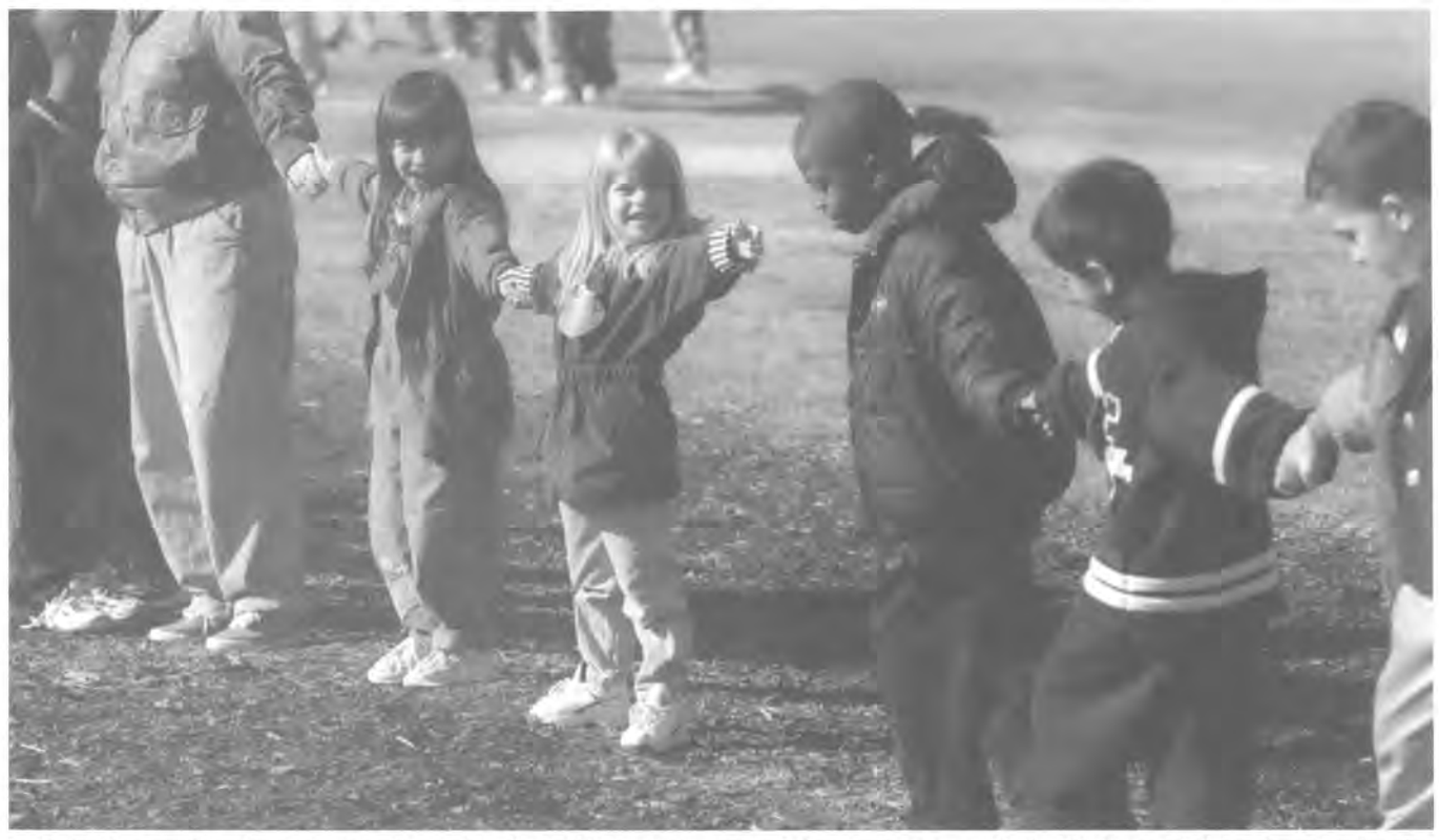
Integration not only evened out racial disparities, but class differences as well. A shift to neighborhood schools would increase concentrations of poverty by up to 40 percent.

measure of school poverty that school officials use: the number of students who qualify for a free or reducedprice lunch. More students qualify for the lunch program because its income limit is significantly higher.