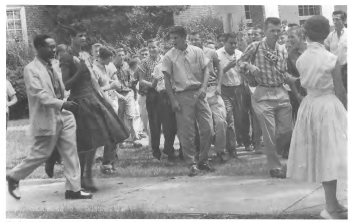
The forced integration of Charlotte's schools brought familiar images of clashes between white students and black students under federal protection.

he most daunting challenge of neighborhood schools – more than an increase in one-race classrooms – could be inner-city campuses packed with Charlotte-Mecklenburg's poorest children.